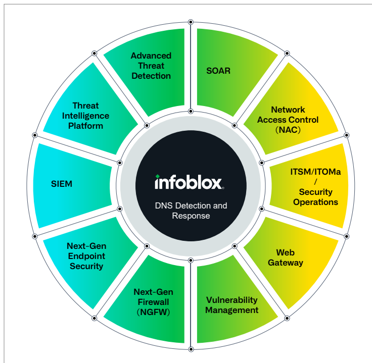
Figure 2: BloxOne Threat Defense integrates with the entire cybersecurity ecosystem

Senior System Administrator and Network Engineer, City University of Seattle